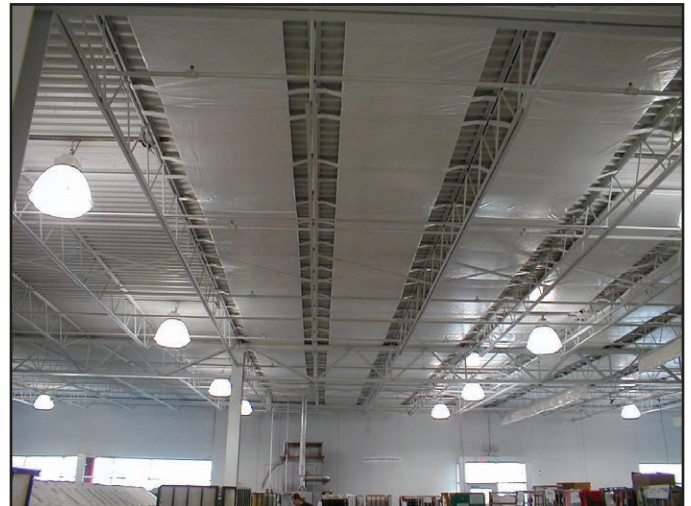
S4 Ceiling Installation in an Industrial Facility

S4 absorption panels can be steam cleaned and are designed to resist most conditions which are found inside machinery enclosures.