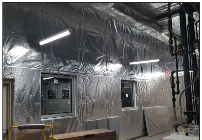
S4 Wall and Ceiling Installation in Generator Room