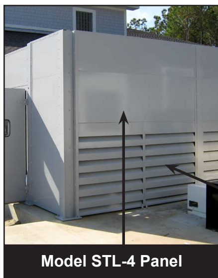
Model STL-4 Panel