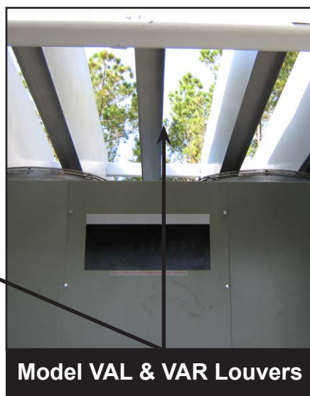
Model VAL & VAR Louvers